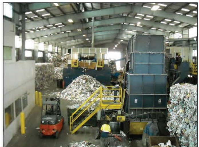
March Mini-Trip to the Recology Recycling in Samoa. Everyone said it was very informative.