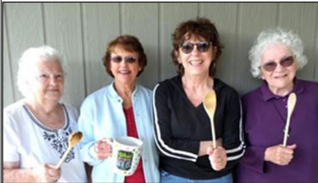
The Cookies Ladies