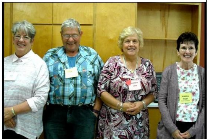
New Board of Directors Members for 2018-2019