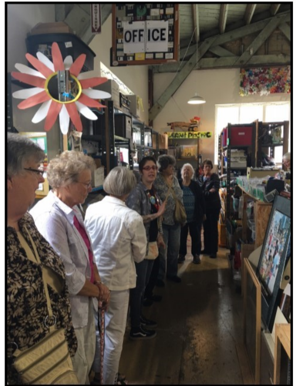
Scrap Humboldt—Mini-Trip 2018