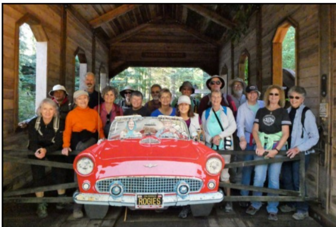
Hiking Group—Fruitland Ridge 2018

If you would like to be a volunteer, call the office.