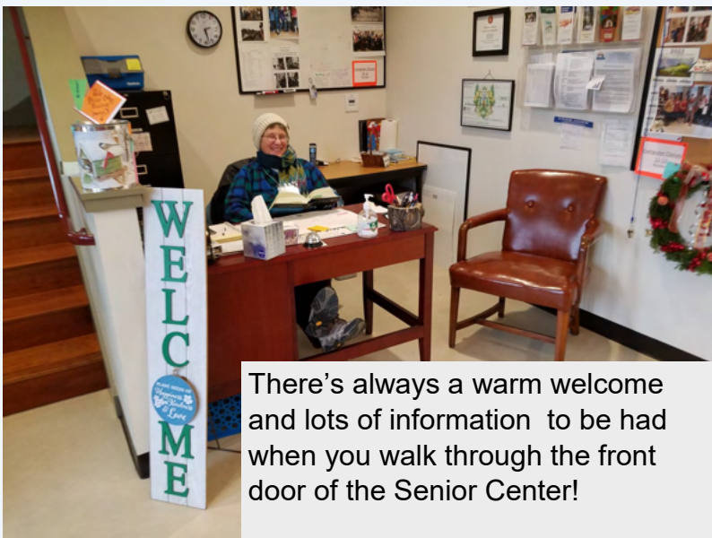
There's always a warm welcome and lots of information to be had when you walk through the front door of the Senior Center!

Many friendly volunteers greeted folks at Peppers Restaurant. They were happy to talk about the Senior Center and all the activities available there.