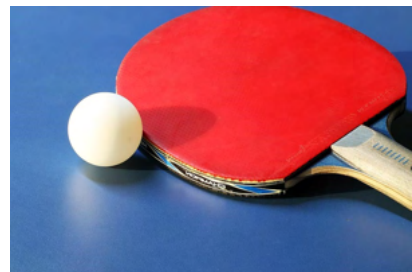
Table open for use. Give a call to see if available.