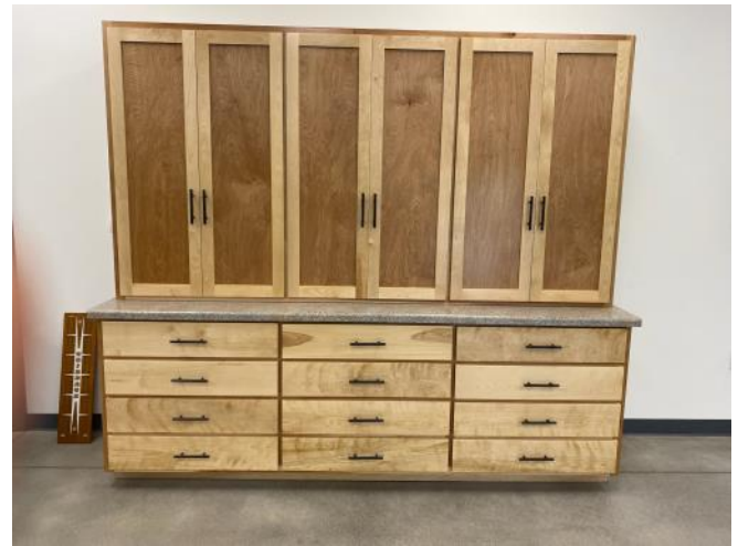
The new drawers and cabinets are a big hit!

Are you having problems understanding or need help to navigate insurance issues or Dr. bills?