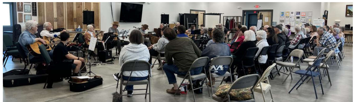
Open mic is drawing good crowds. It is now being held at the Fortuna Senior Center and the musicians and participants seem to like the new home.