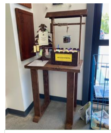
Seniors wishing well and Suggestion box.