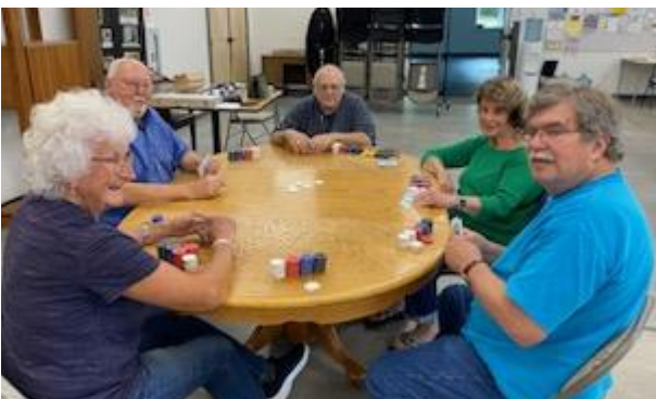
Poker Mondays 3-6