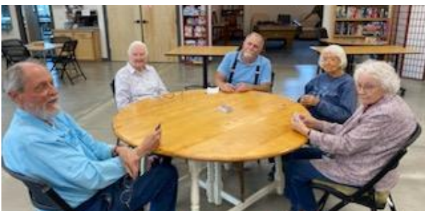
Games Monday 1:15—3:00