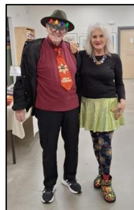
Photos from December 21 Potluck Holiday Luncheon