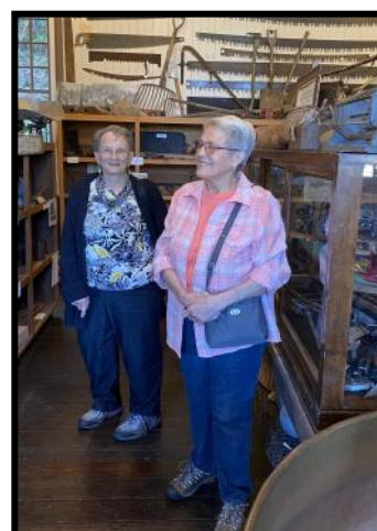
FEBRUARY MINI TRIP: Fortuna Depot Museum located in Rohner Park. Fun times!